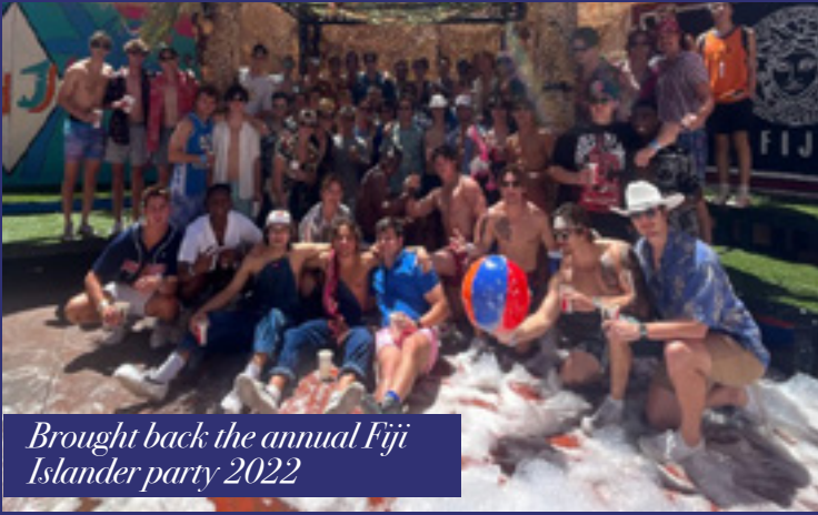
Brought back the annual Fiji Islander party 2022