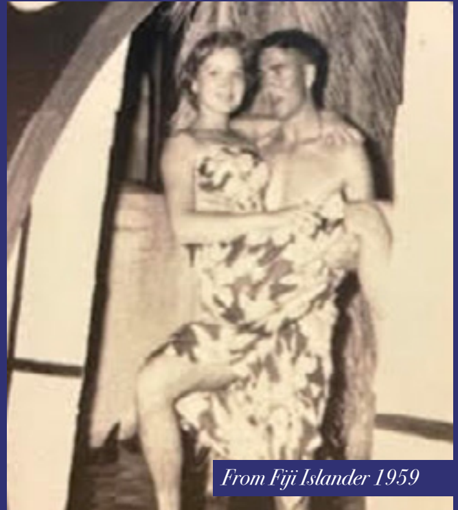
From Fiji Islander 1959